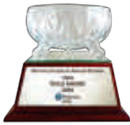
Gold Award Pearson, UK 2020