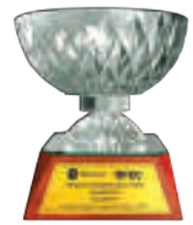
Gold Award Pearson, UK 2017