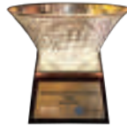
Gold Award Pearson, UK 2018