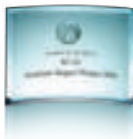
Academic Impact Winner 2016