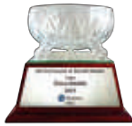
Gold Award Pearson, UK 2019