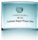
Academic Impact Winner 2016