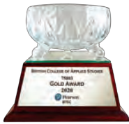
Gold Award Pearson, UK 2020