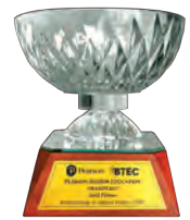
Gold Award Pearson, UK 2017