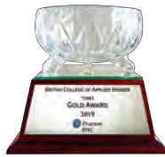
Gold Award Pearson, UK 2019