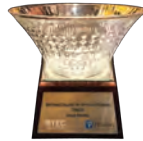
Gold Award Pearson, UK 2018