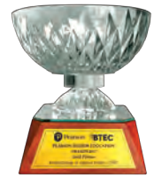
Gold Award Pearson, UK 2017