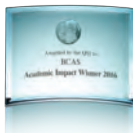
Academic Impact Winner 2016